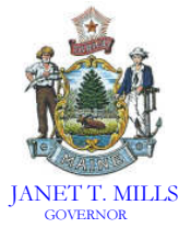
JANET T. MILLS GOVERNOR

STATE OF MAINE DEPARTMENT OF INLAND FISHERIES & WILDLIFE 353 WATER STREET 41 STATE HOUSE STATION AUGUSTA ME 04333-0041