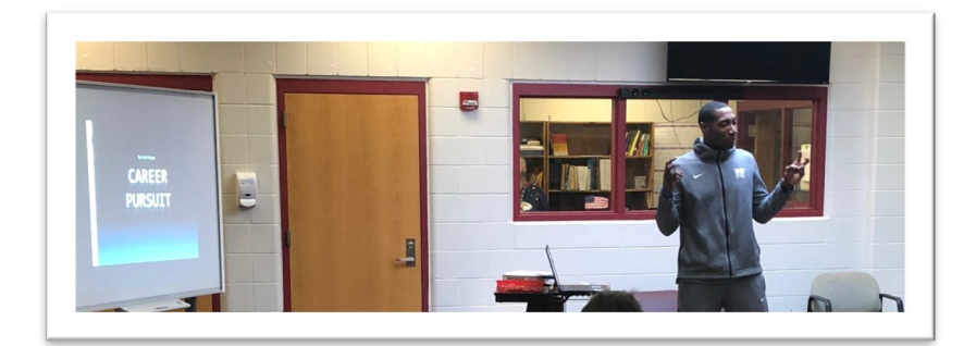
Career Exploration Project A.R. Gould School

Our vocational programming also gives our students job searches, since they already have the competent knowledge that they need to enter the field.