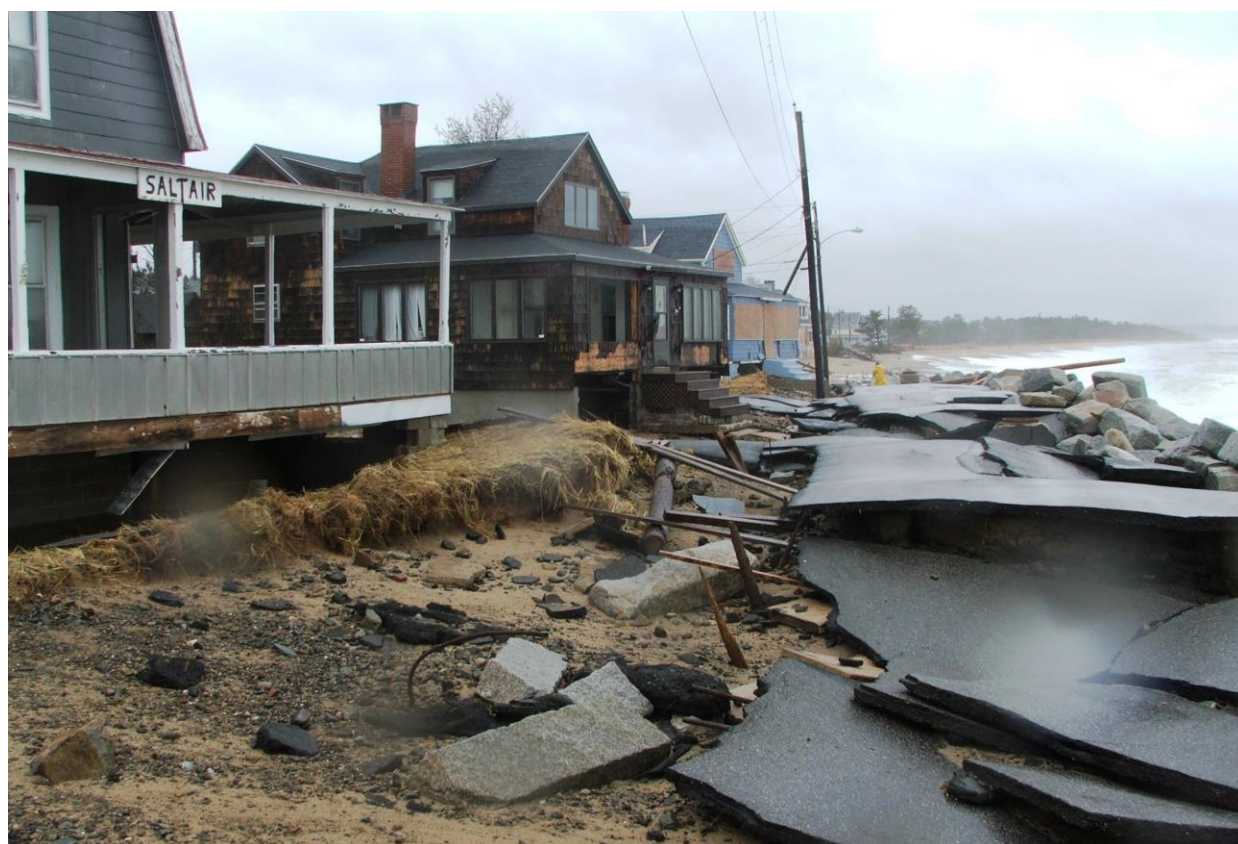
Above: (Saco, ME) Camp Ellis beachfront property after the April 2007 nor'easter.

The Maine Floodplain Management Program does not discriminate on the basis of disability in admission to, access to, or operations of its programs, services, or activities. This material is available in alternate format by contacting the Coordinator for the American Disabilities Act (ADA).