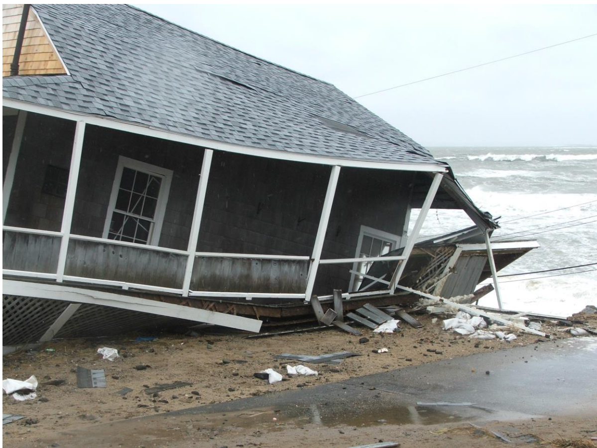
Patriot's Day Flood 2007 Saco (Camp Ellis) Maine

A Resource Tool for Land Use Certification in the Code Enforcement Officer Training and Certification Program and a Reference for Other Professionals