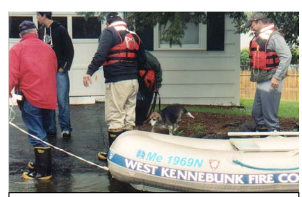
(Kennebunk, ME) Rescue workers after April 2007 Nor'easter.

The Community also must adopt a Resolution agreeing to: