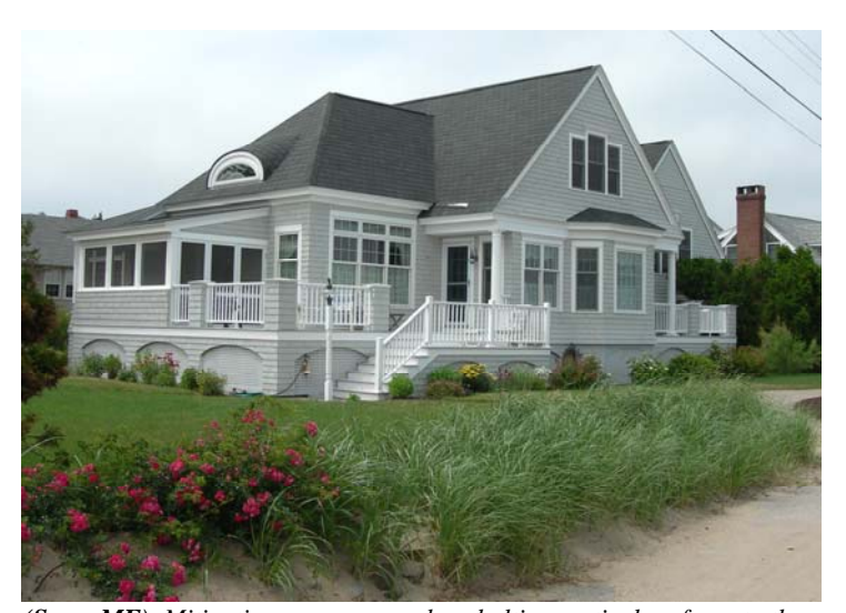
(Saco, ME) Mitigation measures such as bolting vertical surfaces to the foundation and using hurricane-resistant shingles paid off for owners of this home during 2007 Nor-Easter.

The "b" ordinances are used by communities which do not have detailed studies or elevations on their maps. The floodplains on those maps are designated only as "A" zones.