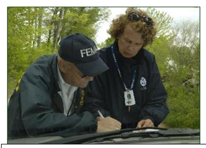
Information gathered by FEMA preliminary disaster assessment teams may be included in floodplain records as appropriate. This team surveyed damage in Shapleigh, ME, after the spring 2006 floods.

The Federal government provides federally backed flood insurance in exchange for good floodplain management, via an ordinance that regulates all development in the special flood hazard areas of a community. Flood hazard areas are identified on maps that have been developed by the federal government and distributed to states and communities. discussed in the Introduction to this handbook the National Flood Insurance Act established the National Flood Insurance Program and the Act and subsequent NFIP Regulations at 44 CFR Parts 59 through 78 give us the frame work for the Federal, State, and Local requirement to implement and manage the Program. The NFIP is the basic underpinning for what we now call floodplain management in national floodplain management most discussions.