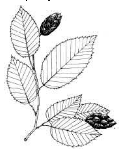
The name "hophornbeam" refers to the fruit, which closely resembles the true hops.

astern hophornbeam or ironwood is a small tree with either an open or rounded crown. It reaches a height of 20–30 feet and a diameter of 6–10 inches. The branches are long and slender, with ends that are somewhat drooping.