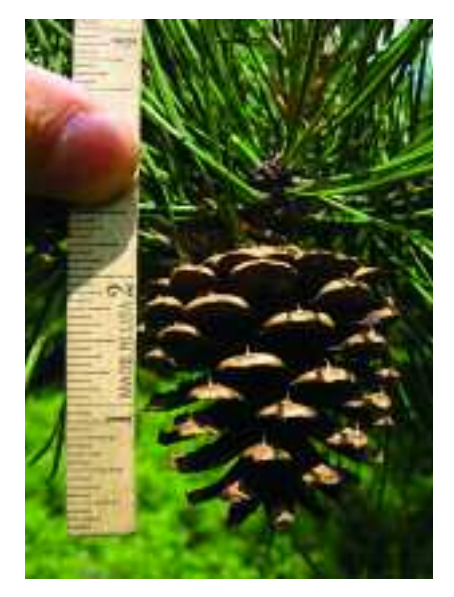
Pitch pine cones have a sharp prickle at the end of each scale.

on short, hardly-noticeable stalks, and are often produced in clusters. A sharp, rigid, curved prickle is produced on the tip of each scale. The cones open gradually during midwinter. Seeds are released over a period of several years. Cones often remain on the trees 10–12 years. Fresh cones are used in wreath decorations.