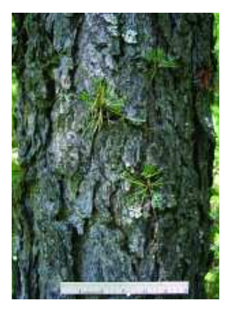
Pitch pine often has needles growing directly out of the trunk. This plus its clusters of 3 needles make it easy to recognize.