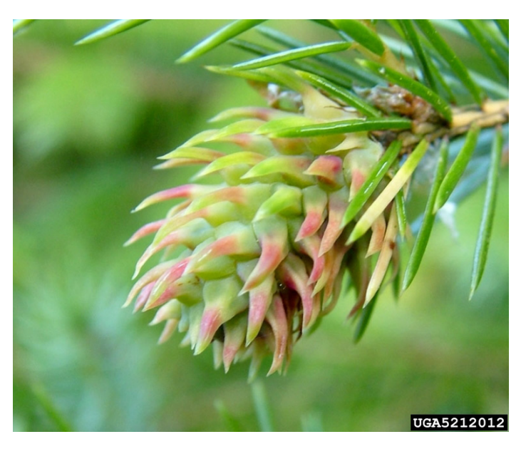
Cooley spruce gall adelgid

Cooley Spruce Gall. This cone-like gall on the tips of new growth of Colorado blue, Sitka and Engelmann spruces is caused by waxy-tailed, aphid-like insects called adelgids. The gall is green or purplish in color, 1 to 2 inches long, 1/2 to 3/4 inches in diameter and resembles a small pineapple in an early stage of development. In mid-summer, the gall opens to release the aphids that have been developing inside; it then turns brown and looks like a small pine cone. On Douglas-fir this same gall maker will twist and discolor needles in early May.