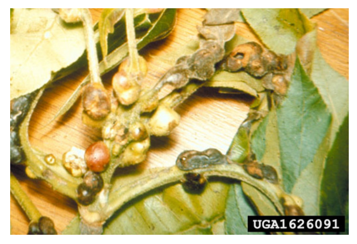
Hickory pouch gall

Control. Be sure to remove and destroy old galls before eggs hatch in the spring.