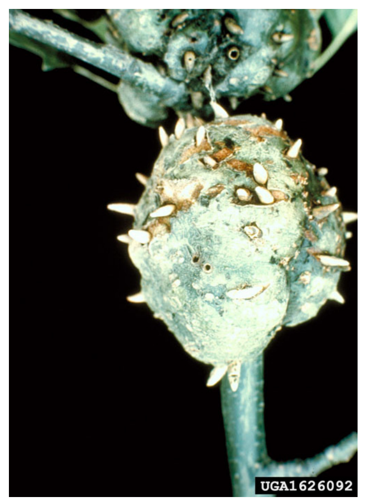
Horned oak gall