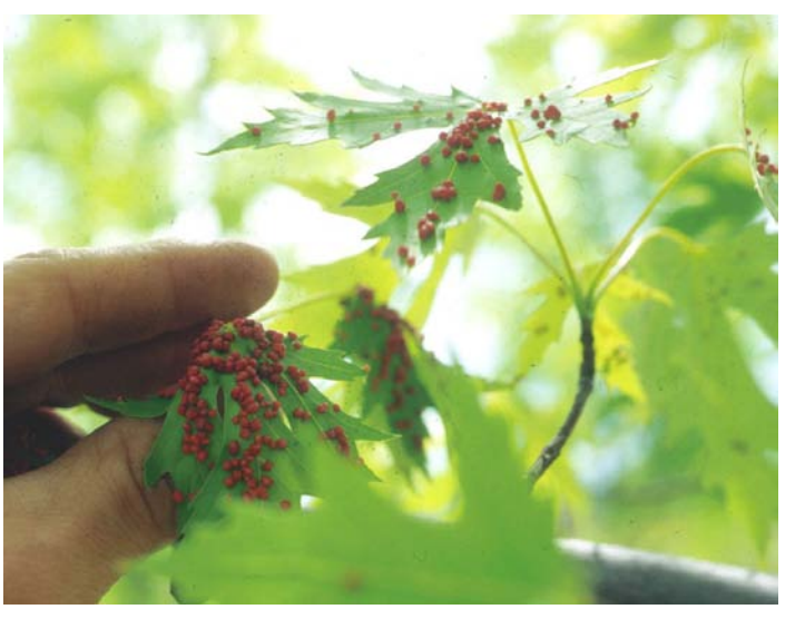
Maple bladder gall

The maple bladder gall mites overwinter in cracks and crevices of the bark. As the buds swell in the early spring, they migrate out on the bud scales. This is when mites are most susceptible to dormant applications of oil spray. When the buds open, the mites feed on the newly developing leaves. In response to this feeding, hollow galls are formed. The mites then live, feed, and mate inside. In fall, mites move back to the bark to hide over the winter.