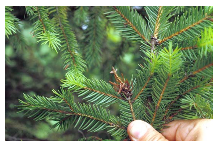
Eastern spruce gall

Apply insecticides to kill adelgid immatures in spring. Effective materials include summer rates of horticultural oil, insecticidal soap, carbaryl (Sevin 50WP) or imidacloprid (Merit 75 WSP).