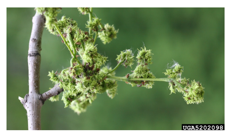
Ash flower gall mite

Control. Adult mites are most susceptible to dormant applications of oil when they become active in spring prior to bud break. Galls should be pruned from the plant prior to this period of mite activity in the spring.