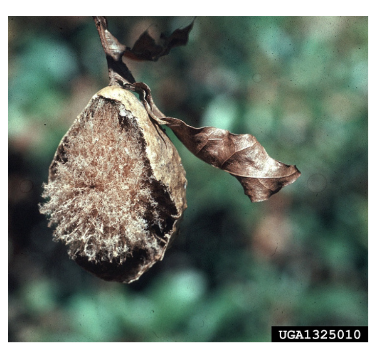
Oak apple gall

Control. Remove young expanding twig galls as soon as they are visible in the spring. Cutting off old dried galls is not necessary. Applications of insecticides can kill leaf galls, but do not reduce the number of new stem galls produced.