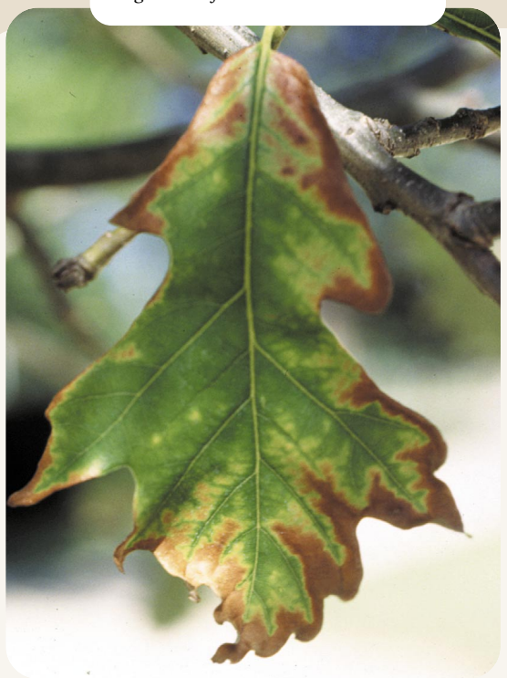
Fig. 2 - Leaf scorch on white oak.

Salt damage, especially from deicing salt used on roads, sidewalks, or driveways near the tree, will also cause leaf scorch. Girdling roots, drought, poor growing locations, and other factors aggravate the problem. If these problems cannot be corrected, you can expect leaf scorch to recur each year during summer drought periods; try to anticipate such problems and follow the appropriate remedies as outlined below.