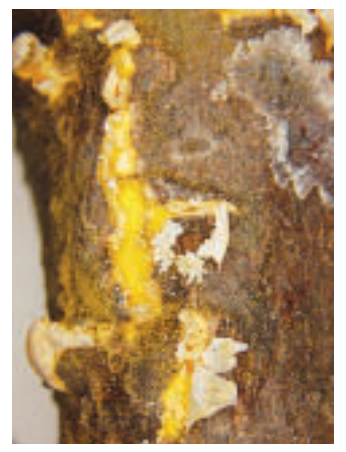
Figure 5. Sticky, yellow liquid exuded by a canker just before hardening off.

The fungus grows into the bark tissue at a rate of 5-6 inches (12.5-15.0 cm) per year and begins to form cankers after the first year of infection (Fig. 3). In spring, 3-4 vears after the initial infection, pale vellow or cream-colored blisters (aecia) rupture through the bark of active cankers (Fig. 4). They release powdery, yellow spores (aeciospores) that are carried in the wind over long distances to the alternate host and cause infection. The aeciospores can only infect Ribes species. After the spores are released, the cankered area on the pine remains swollen and roughened. In summer, the sticky, yellow fluid that exudes from the site hardens and leaves small, brown-rustcolored scars (Fig. 5).