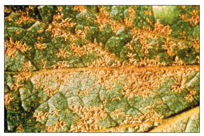
Figure 2. Close up of telia and some uredia on the lower surface of a black currant leaf infected with white pine blister rust.

resin or sticky yellowish fluid (spermagonia), cankers that are diamond-shaped to elliptic with a dead center surrounded by a band of yellowish-green infected bark, light yellow-orange aecia, and death of the tree.