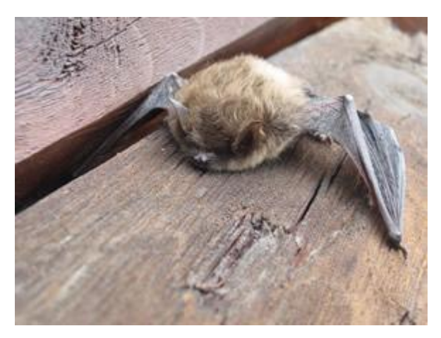
Figure 2. Big Brown Bat (Eptesicus fucus)

All mammals, including bats, give birth to live young. Most produce one pup a year, although a few species give birth to litters of 2 to 4 pups. Some bat species mate in the fall or winter, but they have the ability to delay fertilization and