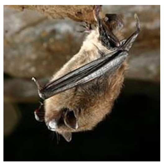
Figure 1. Little Brown Bat (Myotis lucifugus)

Direct contact with a bat may result in potential rabies exposure, so all bats that come in contact with students, faculty or staff must be tested for rabies.