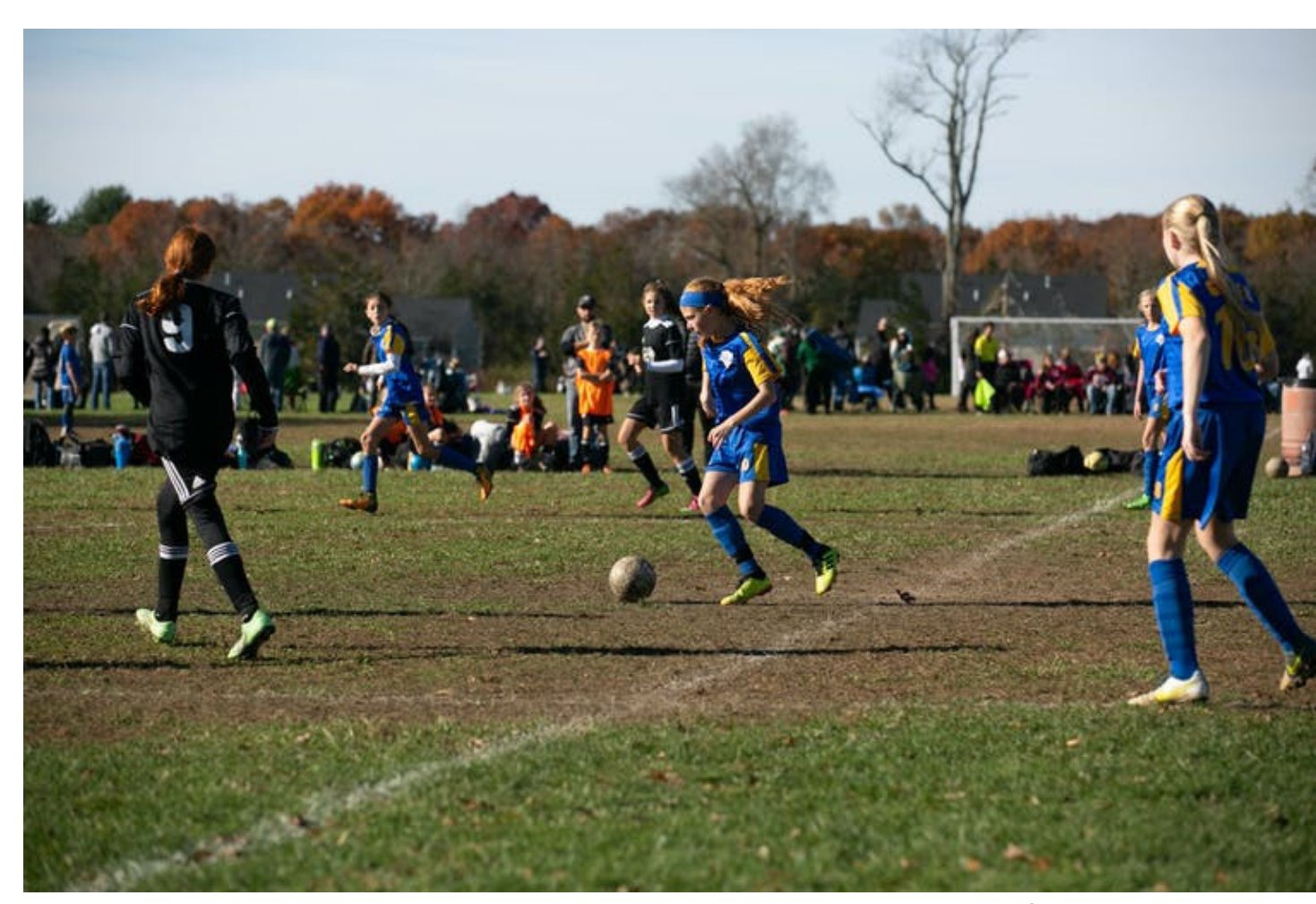
Gina Henderson, CC BY-ND

Groundskeeper determines herbicide treatment needed to improve field playability