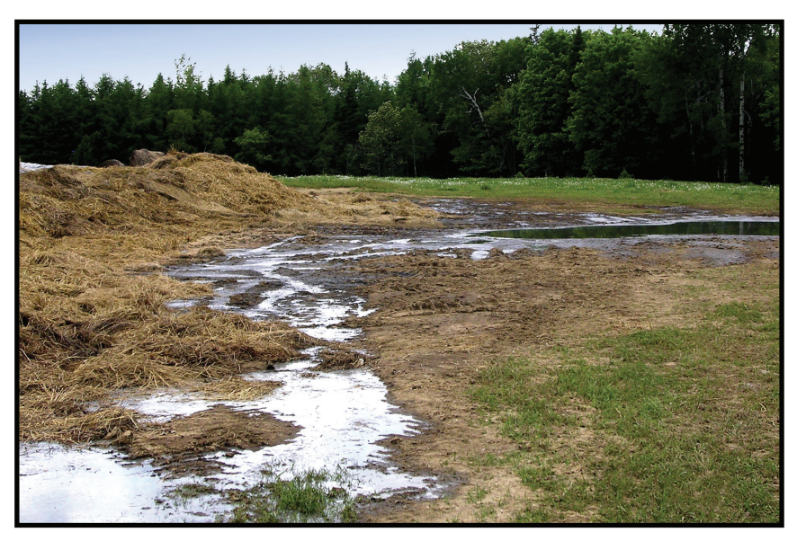
A manure storage area with excessive runoff

proceeding against the farm, the Department will testify on the farmer's behalf. The Department cannot provide legal counsel or pay any fees for legal services contracted by the farmer.