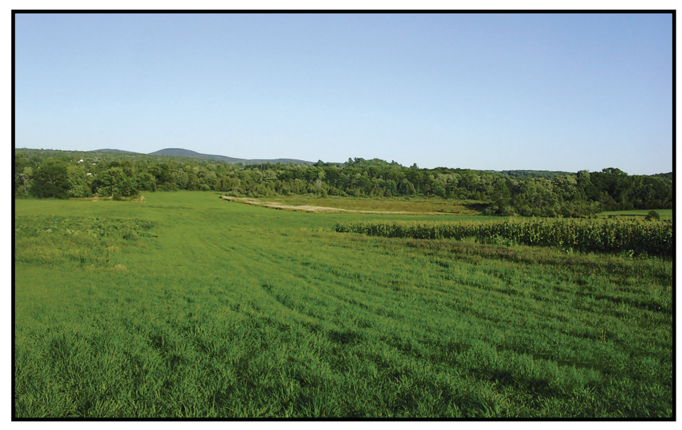
Crops and fields with minimal erosion

The success of the Maine Agricultural Compliance Program has been the result of an effective working relationship between farmers, the Department of Agriculture, Conservation and Forestry, and other state and federal agencies. In an era when most citizens have become increasingly disassociated with farming operations, conflicts often arise between the public and farmers who must utilize available land and water resources. The Agricultural Compliance Program serves as an effective intermediary between farmers and others for resolving conflicts in a timely and meaningful manner.