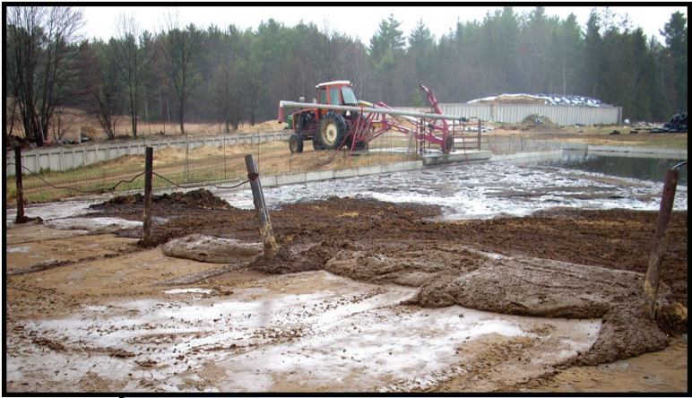
A manure storage structure too full with runoff

The Agricultural Compliance Program ACO will diligently investigate all complaints and determine whether a legitimate complaint exists. The Right-to-Farm Law also has a "good faith" provision that has implications for individuals who bring private actions against a farmer if it is determined that the action was not brought in good faith and was frivolous or intended only for harassment.