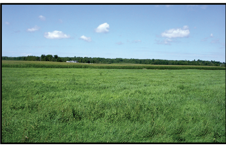
Well-managed crop land