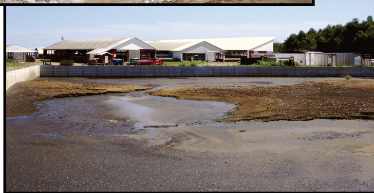
A modern manure storage structure with adequate capacity and no leaks