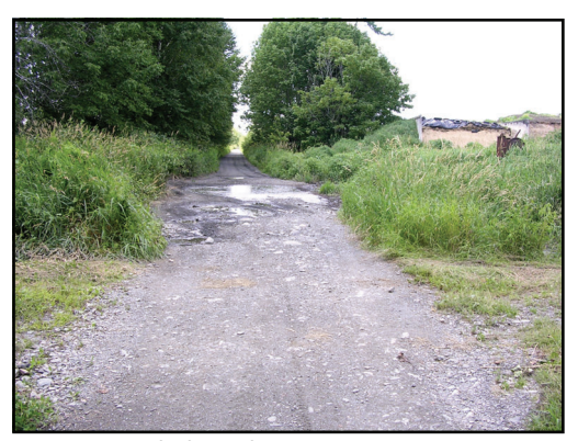
A leaking silage storage area that requires remediation

important aspect of the program is that it helps a farmer to develop or remain in compliance with best management practices (BMPs), which are the basis for a farmer's "Right-to-Farm" protection.