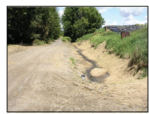
The same silage storage area after improvements

The Agricultural Compliance Program (ACP) of the Maine Department of Agriculture, Conservation and Forestry (Department) was developed to investigate and resolve complaints from the public concerning farms and farm operations that involve threats to human or animal health and safety, and to the environment. An