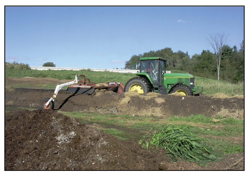
Composting animal mortalities - a proven method for dealing with an inevitable event

After a complaint is received by the Department, an ACO will contact the farmer and provide him or her with the name of the complainant, if requested, the nature of the complaint, and sufficient information to allow the farmer to identify and address the alleged problem(s). The ACO usually will notify the farmer in advance of his arrival on the farm. The ACO then will conduct an on-site investigation and determine whether an agricultural problem actually exists. During the investigation, the ACO