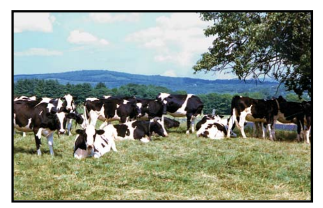
Which farms are required to develop and implement an NMP?