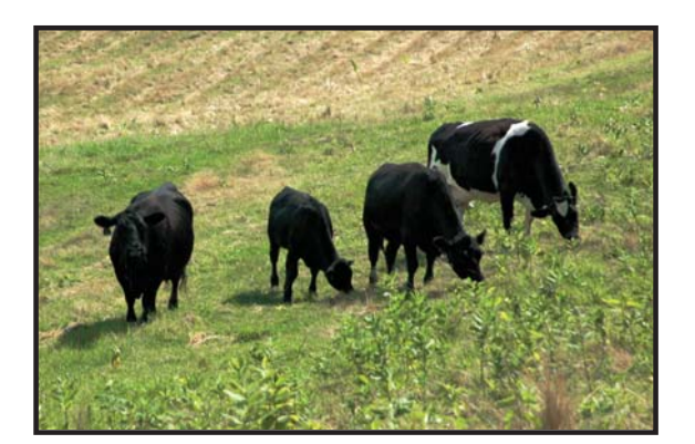
Yes. A Comprehensive Nutrient Management Plan (CNMP) may be prepared for a farm. These plans are written by certain U.S.D.A.