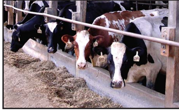
constructing certain projects. A Nutrient Management Loan Program, available through the Finance Authority of Maine

U.S.D.A. NRCS also has funds available through the Environmental Quality Incentives Program (EQIP) or from other programs for qualifying projects. The U.S.D.A. Farm Service Agency offers farm operating loans for