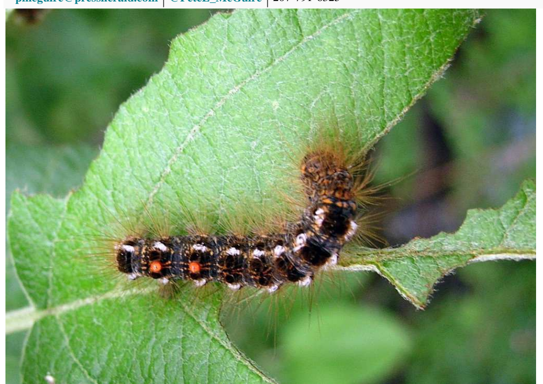
The browntail moth caterpillar damages trees and has prickly hairs covering its body, and hairs cause skin rashes.

BY PETER MCGUIRE STAFF WRITER pmcguire@pressherald.com | @PeteL_McGuire | 207-791-6325