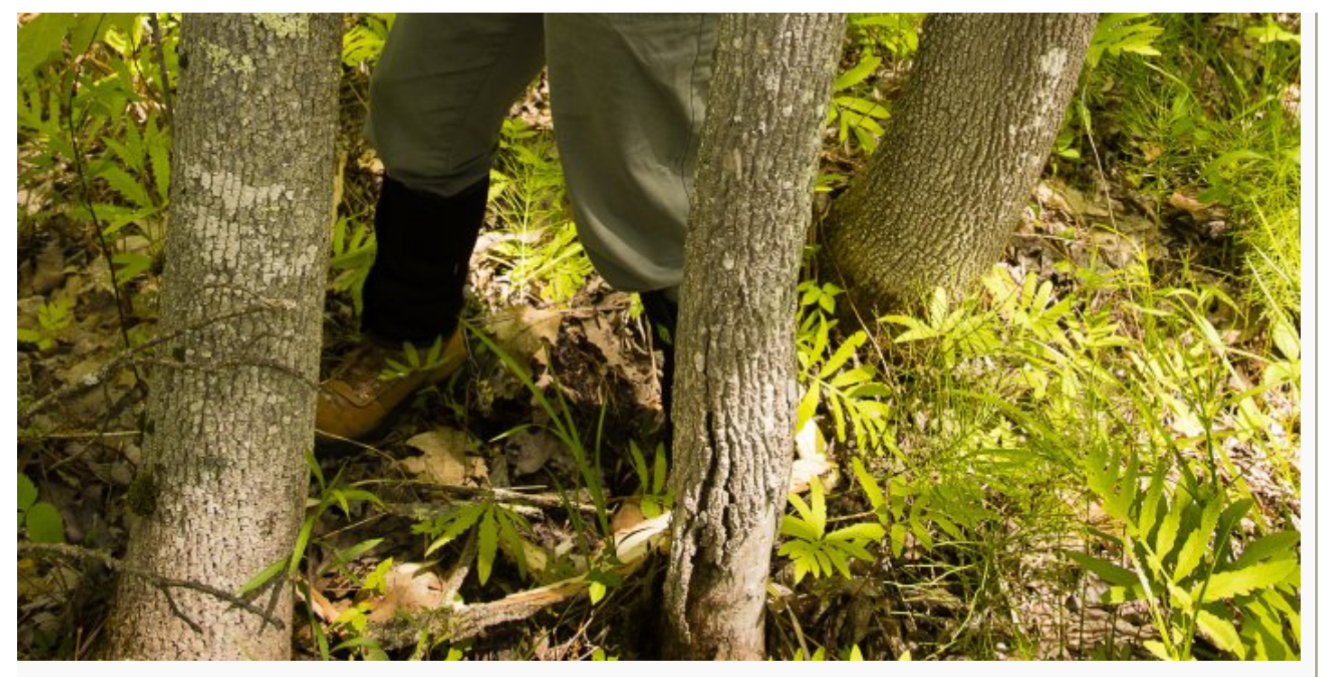
colleen Teerling strips the bark from an ash tree at Lake St. George State Park in Liberty. The section of tree will be examined to see if the insect is in Maine.

where it was first spotted in the 1930s, but only one true specimen of it existed and that was in a museum.