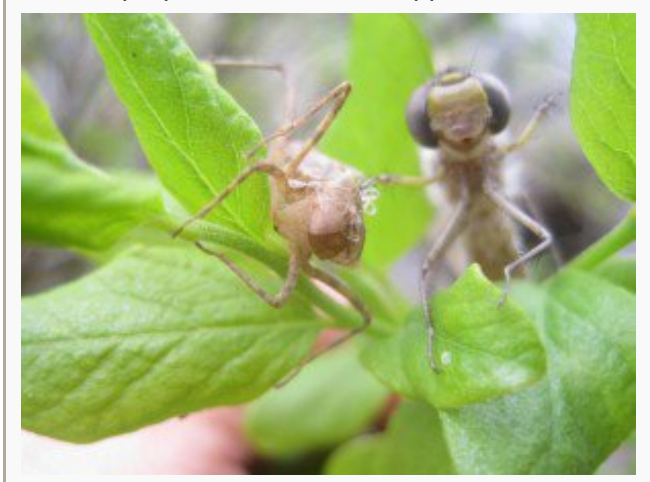
A dragonfly adult next to its shed exoskeleton. Dragonflies serve as bio-sentinels for mercury pollution and are easier to test for contamination than, say, fish.

"It is not an easy thing to get permission," said Beth Swartz, a wildlife biologist with the Department of Inland Fisheries and Wildlife who conducted the research that tracked the rare and elusive Roaring Brook Mayfly deep in the wilds of Baxter. The mayfly had been named for the Maine location