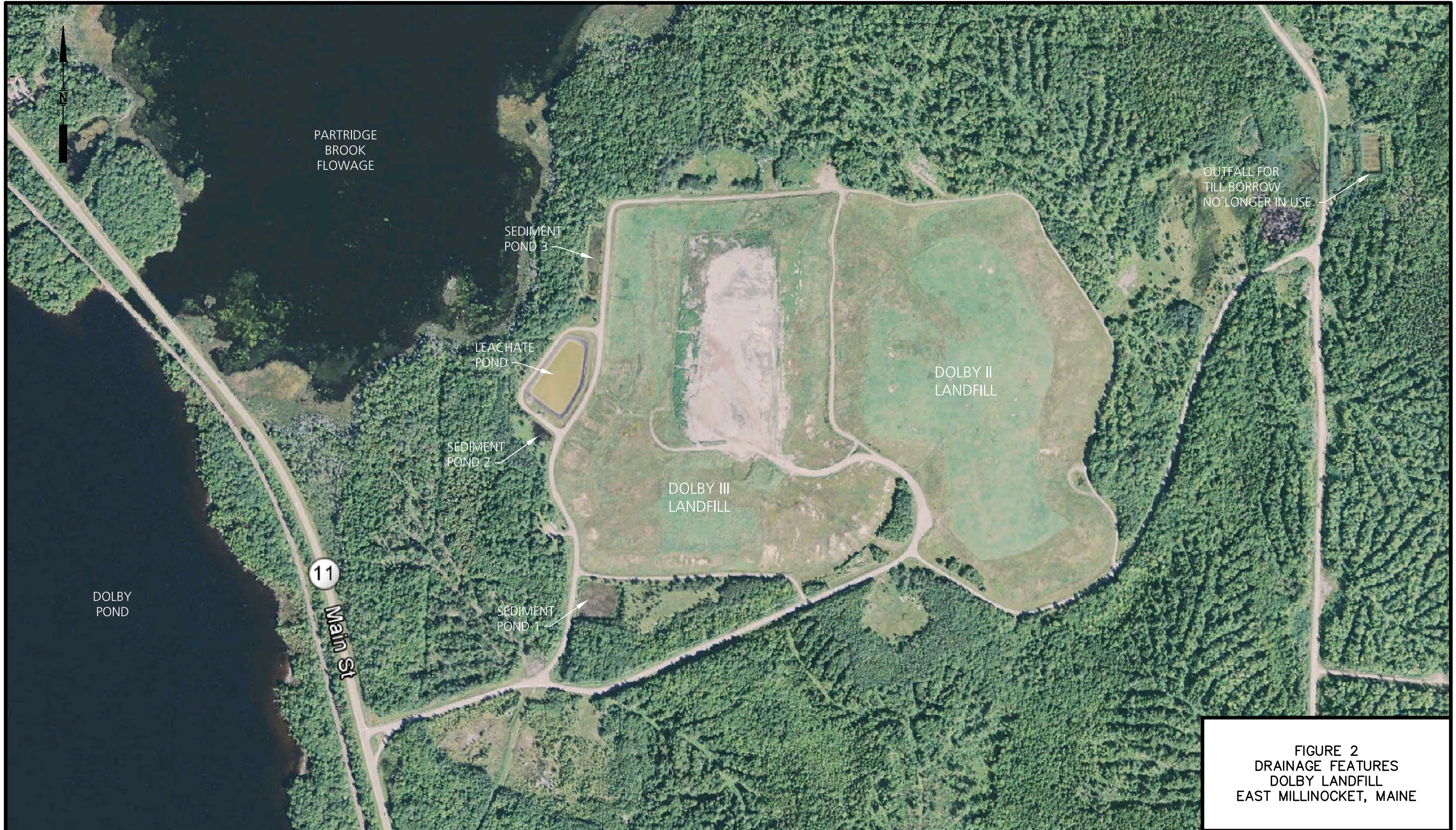
FIGURE 2 DRAINAGE FEATURES DOLBY LANDFILL EAST MILLINOCKET, MAINE