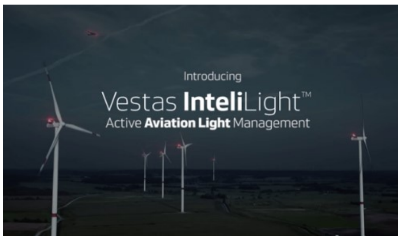
Vestas' IntelliLight combines aircraft-detection and aviation light control to provide aviation safety at wind farms.

Vestas' IntelliLight, its active aviation light-management solution for wind turbines, has demonstrated performance to FAA standards and is officially ready for use in the U.S. The approval follows authority approval in Canada, Finland, Germany, Norway, and Sweden.