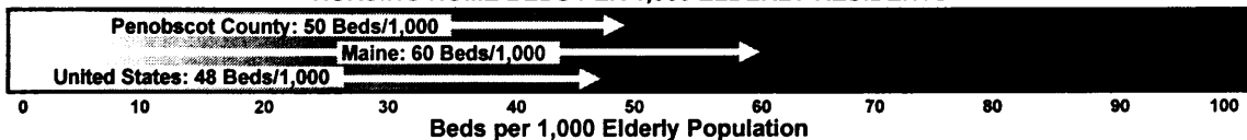
NURSING HOME BEDS PER 1,000 ELDERLY RESIDENTS

NOTES: Data on health care resources must be considered in conjunction with health status indicators, such as those on the accompanying Health Status Indicators FACT SHEET. In all instances, the most recent available data were used; this was not always 1992 information. Complete citations are available for data sources upon request. All county rates were compared to national rates when possible; unless noted, differences in rates were not statistically significant, i.e., they could be accounted for by chance alone.