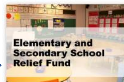
Elementary and Secondary School Emergency Relief Fund (ESSER)