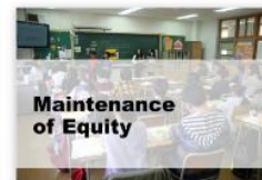
Maintenance of Equity