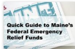
Quick Guide to Maine's Federal Emergency Relief Funds