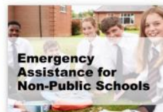
Emergency Assistance for Non-Public Schools (EANS)