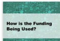
Emergency Relief Funding Dashboard