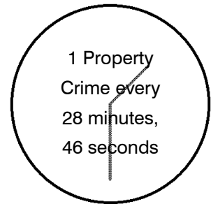
Number of Offenses — Comparative Data 2017–2018