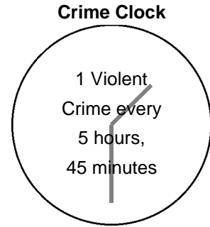
Number of Offenses — Comparative Data 2005–2006

The 2006 crime rate for violent crime is 1.15 offenses per 1,000 population. Violent crimes represent 4.4% of all reported index crimes. Police cleared 894 violent crimes for a 58.7 clearance rate.