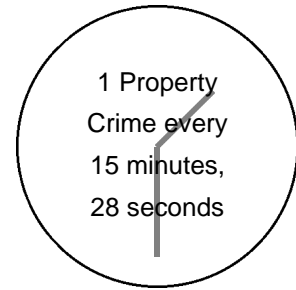
Number of Offenses — Comparative Data 2010–2011