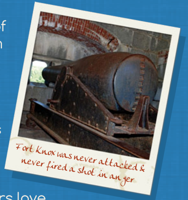
Fort Knox was never attacked & never fired a shot in anger