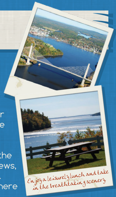
Enjoy a leisurely lunch and take in the breathtaking scenery

The Penobscot Narrows Bridge and Observatory is the crown jewel of coastal Maine with its spectacular views, stunning design and unique link to historic Fort Knox. The only observatory bridge in the Western Hemisphere and the tallest in the world, the structure has won multiple awards for engineering excellence.