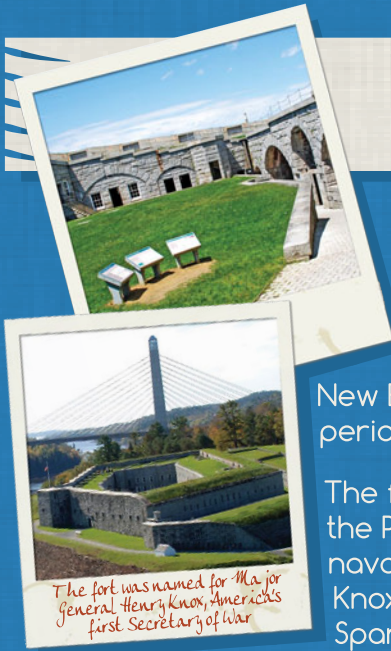
The fort was named for Major General Henry Knox, America's first Secretary of War

Fort Knox bears the distinction of being Maine's first granite fort and is one of the best-preserved seacoast fortifications in America. Troops were stationed here during the Civil War for defensive purposes. During the Spanish-American War about 500 troops from Connecticut used the site for training purposes prior to reassignment. Today, visitors love exploring the vast structure and learning of the rich History of America's first Fort Knox.