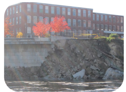
Damage in Biddeford, ME