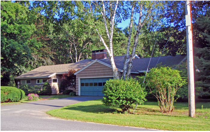
ca. 1960, Brunswick, Wadsworth and Boston., Architects