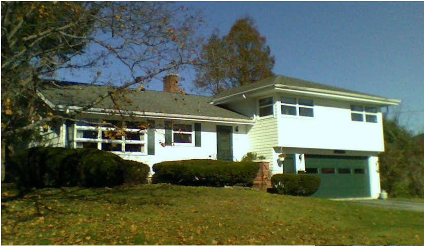
Typical early Split Level examples in Maine. The one-story volume contains the primary entrance and living area, identified by the large “picture” window. The ridge of the roof steps up to accommodate the two story volume, which contains a garage and living space below and sleeping rooms above. In the bottom image, each roof line is a side gable. In the other two examples, the higher roof is a hip while the lower is a side gable.

In Maine examples, the primary entrance is usually (although not always) in the one-story volume and the garage is in the lower level of the two-story volume. A secondary entrance at the garage level is not unusual.