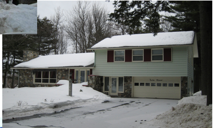
1970, Old Town