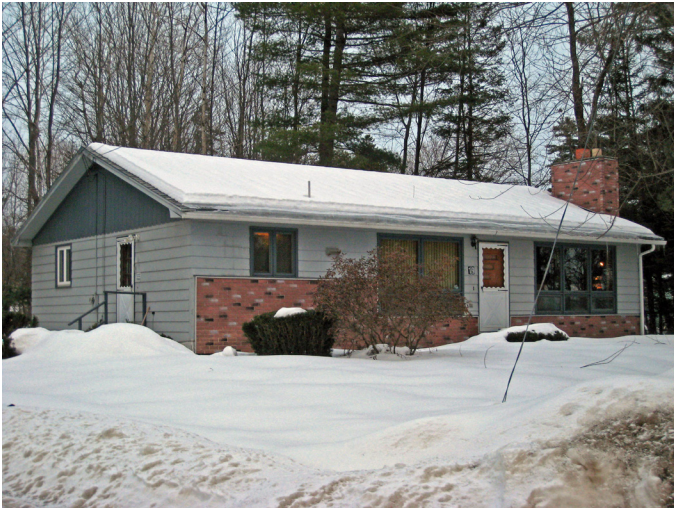
1971, Old Town