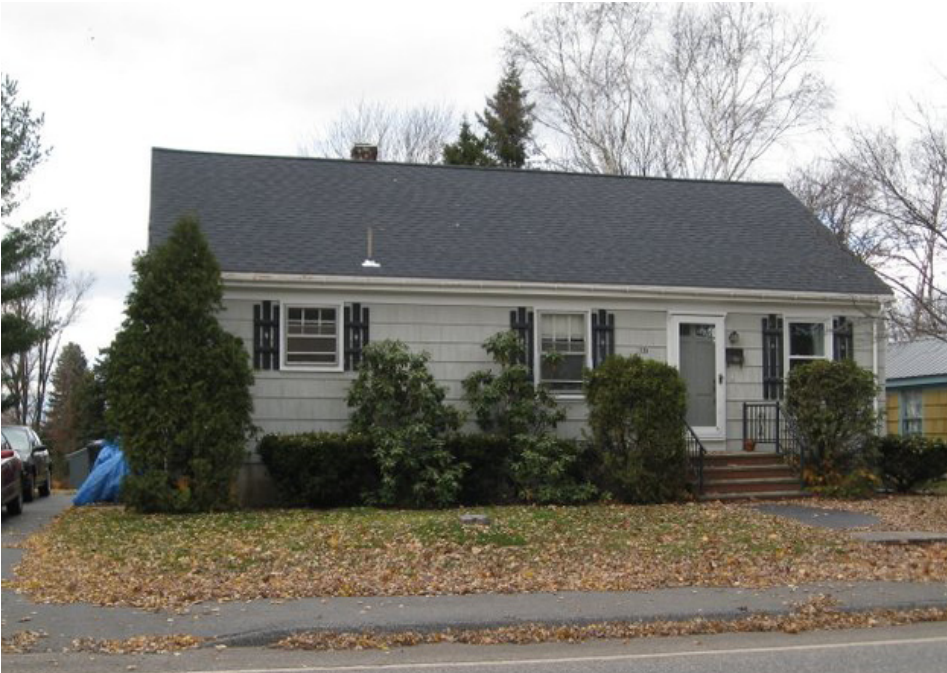
1957, South Portland

Vernacular houses are those that are either so simple they lack enough detail to fit an architectural style, or that combine elements from so many styles the resulting house can't be categorized.