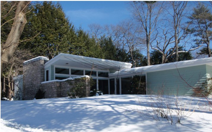
1951, Portland. Wadsworth, Boston, et. al., architects

Roofs are flat, or gable with a very low pitch. Flat roofs likely built-up and low pitched roofs have asphalt shingles. Gable roofs typically have deeply overhanging eaves and may have exposed framing/rafter ends.