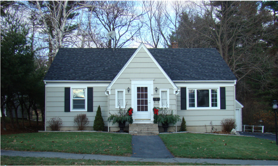
1950 , Augusta