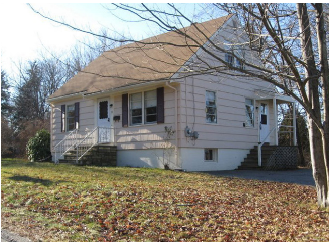
1956, South Portland