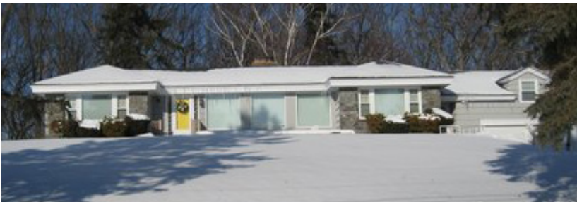
Cape Elizabeth, 1950