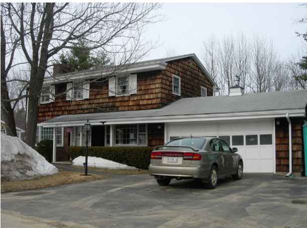
ca. 1967, Lewiston