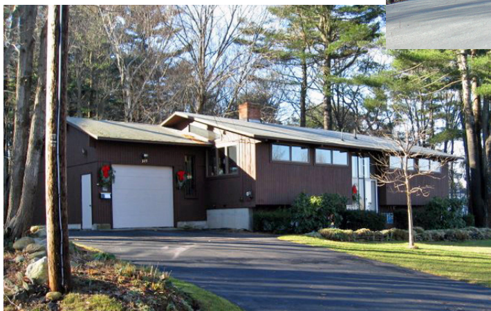
1961, South Portland