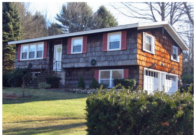
South Portland, 1973