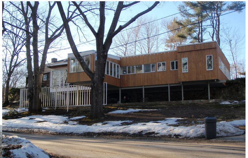
1949, Cape Elizabeth, Marcel Breuer