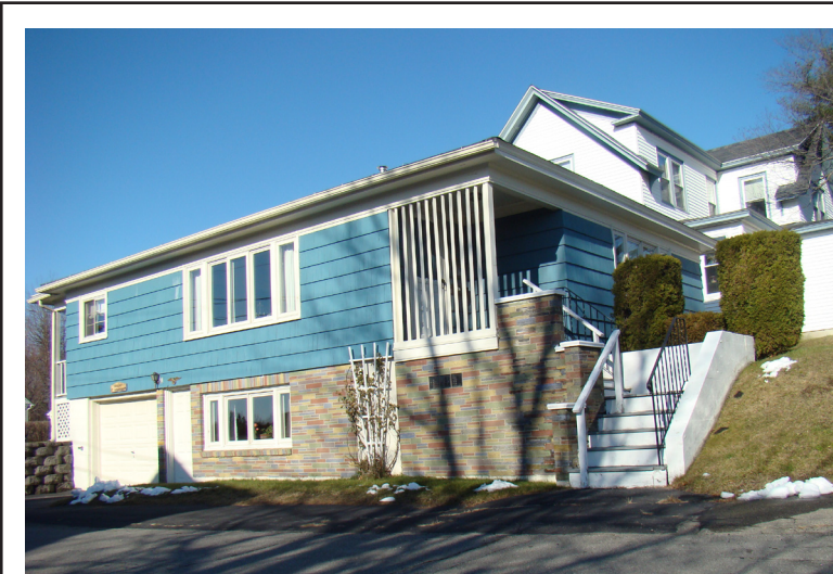
At left, this early example found in Augusta is not quite a Raised Ranch. Although it has an integrated garage and the living areas appear to be on a single, elevated level, it lacks the off center, grade level entrance found in true Raised Ranches. Also note the entrance is in a side, rather than the primary, facade.

By the mid-1960s, the design of the Raised Ranch had become very predictable. The living space, identifiable by its large picture window is on the smaller side, and bedrooms and private spaces, with smaller, higher windows occupy the other side. This placement of distinctive types of spaces on either side of the entrance is similar to the space planning principles of the Split Level, but in a Raised Ranch, the living is on a single rather than multiple levels connected by half flights of stairs. As a result, Raised Ranches have continuous roof lines, while Split Levels have a shift in ridge heights.