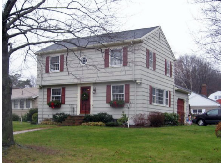
1956, South Portland