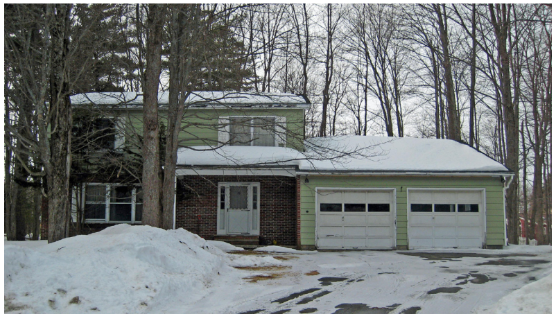
1973, Old Town

On this page, the lower two images show how the garage roof extends to form an entrance porch across the main volume of the two-story house. The two car garage is a prominent feature of the facade.