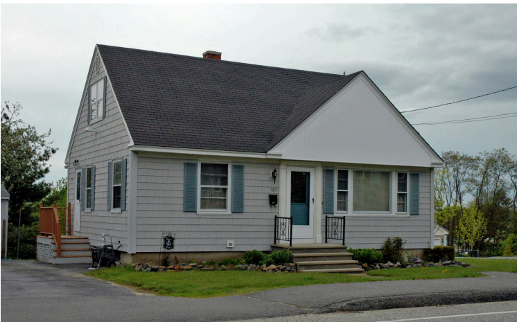
1955, South Portland