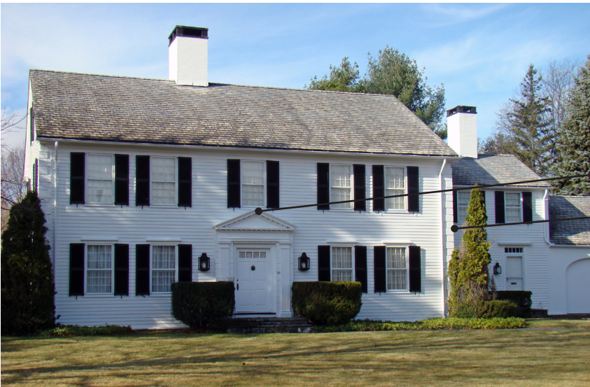
ca. 1958, Augusta