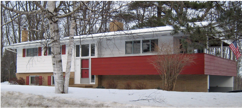
1964, Old Town

By the late 1960s, the Maine-built Raised Ranch is very consistent. The second floor overhangs the first. The entry is in the front facade, slightly off center, and often recessed into the facade. The wider side has two bays, and contains sleeping and private spaces, identifiable by the smaller, higher set window openings. The narrower side contains the living space, which inevitably has a single, large window opening ("picture window"). The garage is integrated in the lower level of the wider side.