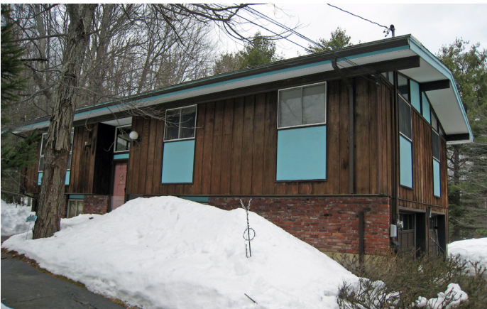
1968, Old Town