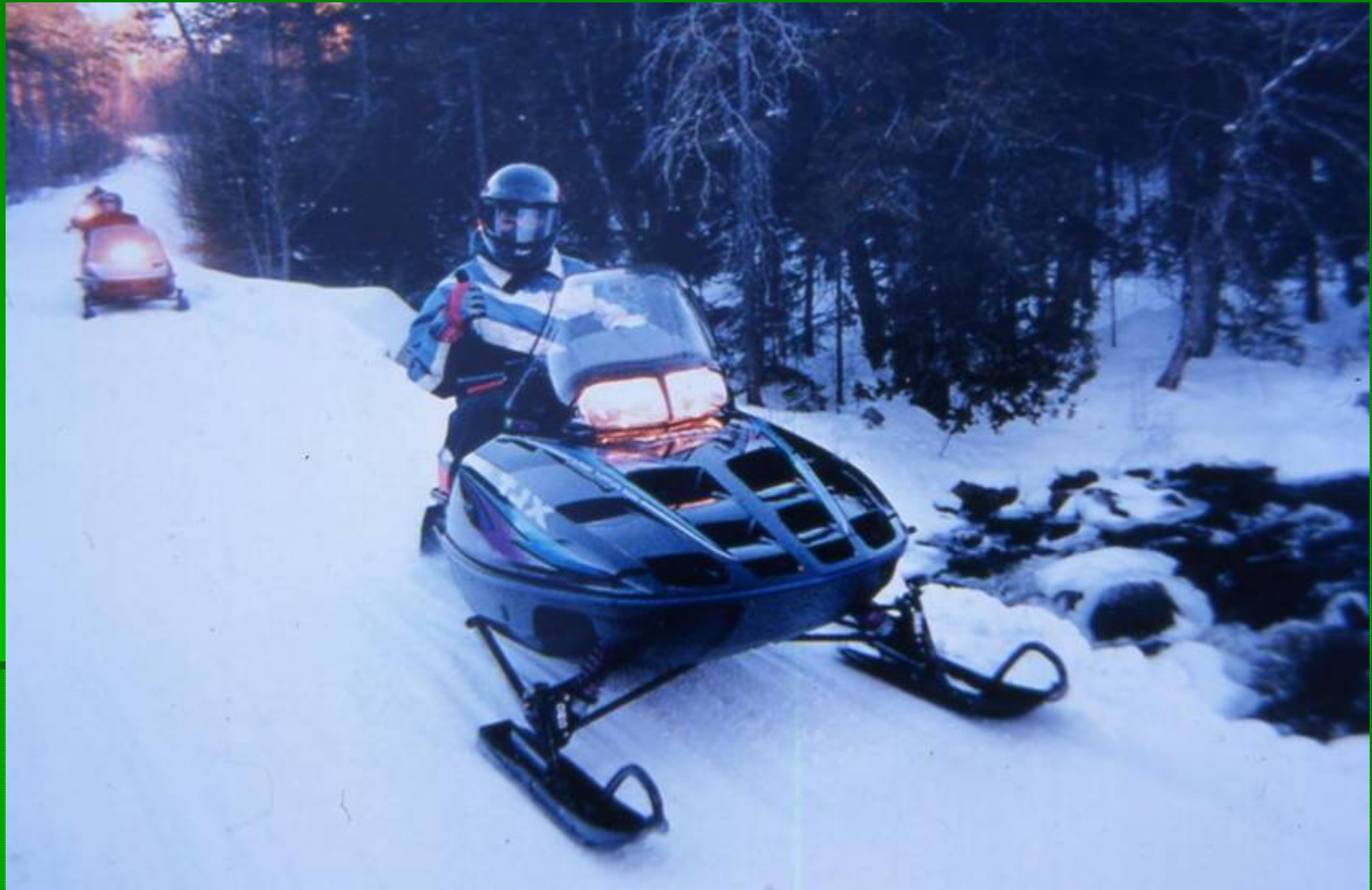
Newport to Dover-Foxcroft Rail Trail