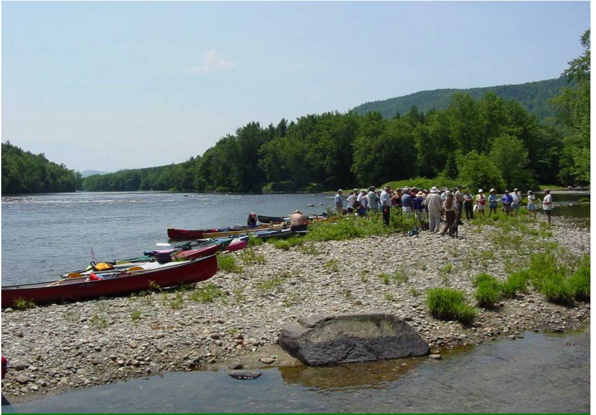
Bear River Rips