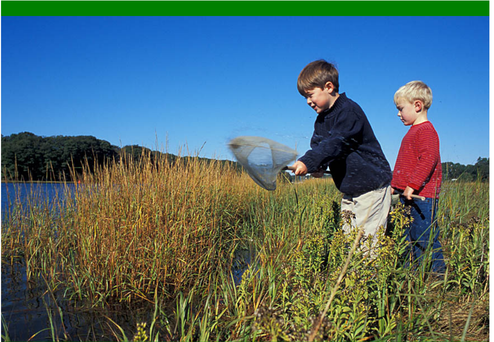
Royal River Preserve