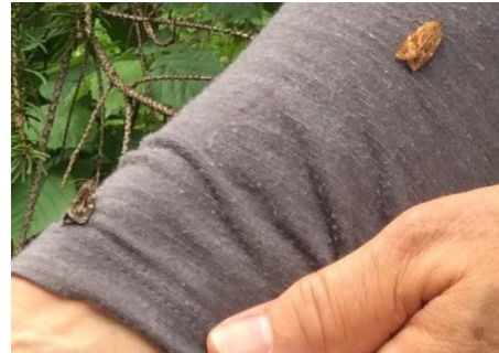
Spruce budworm moths, Forestville, Quebec.

Spruce Budworm ( Choristoneura fumiferana ) – Spruce budworm traps are being collected now by MFS staff, large landowners and land managers across the northern half of the state. The first trap catches counted to date are slightly higher than last year but it is a very small subset of traps put out. There was a large moth flight out of Quebec in mid-July that could be tracked on radar. Most of it appeared to land in the Gaspé Peninsula and New Brunswick and did not make it to Maine.