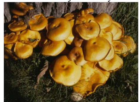
Mushrooms of Armillaria mellea root rot on ash, Durham, New Hampshire.

http://www.fs.fed.us/nrs/pubs/rp/rp_nrs25.pdf