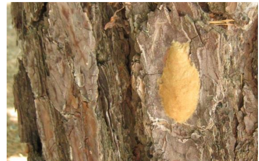
Fresh gypsy moth egg mass on a mature red pine.

Gypsy Moth ( Lymantria dispar ) – A gypsy moth outbreak snuck up on residents of southern New England this year. Forest health staff in Massachusetts attributed the caterpillar’s success to a dry summer in 2014 and a dry spring in 2015 sparing the insect from the fungal disease, Entomophaga maimaiga . MFS will be conducting an egg mass survey later this year to try to forecast next year’s damage. Dry conditions in areas traditionally hard-hit by gypsy moth may have supported building populations. Homeowners can also do their own surveys with the aim of reducing next year’s defoliation. Look for gypsy moth egg masses around your yard and destroy those you can reach.