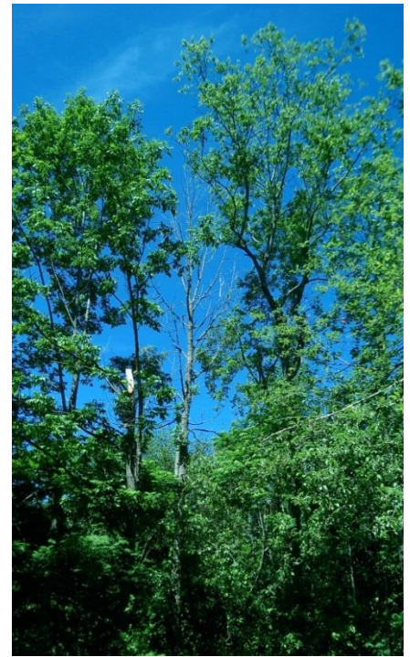
Dead and declining ash in a fence-row, a typical location for ash yellows, Corinth, Maine.

Ash Yellows: The ash yellows pathogen is a phytoplasma organism (similar to bacteria) which invades and colonizes the phloem system of its ash host and develops into a systemic infection. The phytoplasma are presumed to be transmitted by leafhoppers or related insects. Infection by the ash yellows organism results in a gradual growth decline of the tree, with symptomatic dieback of tops and branches occurring over several years. Other symptoms can include epicormic sprouting along the bole and branches, and bark splitting or