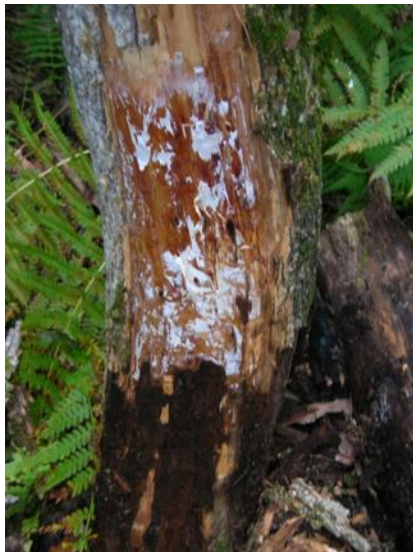
Mycelial "fan" and decay associated with Armillaria root rot on ice-storm damaged ash, Bridgton, Maine.

cracking. Open fields and pastures provide the habitat used by the insect vectors. Because the pathogen is dependent on insect transmission to new hosts, ashes in fence-rows or near open fields are more likely to be infected than those in forest stands. For more information on ash yellows, refer to: http://www.na.fs.fed.us/pubs/howtos/ht_ash/ash_yell.pdf