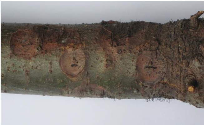
Cankers of Caliciopsis pinea on a white pine sapling, Seboomook Twp, Maine. Note the fruiting bodies (hair-like projections) along stem edge.

In 2014, twenty randomly selected stands were surveyed in Maine, with Caliciopsis pinea identified on white pine regeneration from 16 stands surveyed.