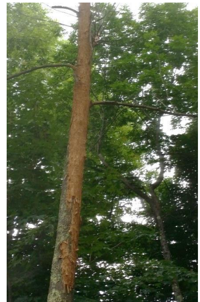
Blanding caused by woodpecker attack on eastern ash bark beetle.

Emerald Ash Borer ( Agilus planipennis ) – Emerald ash borer has not been found in Maine. Purple traps are beginning to be retrieved across the state. This fall and winter be on the lookout for “blanding” of ash trees caused by woodpeckers. These trees are worth a second look, as they may be host to