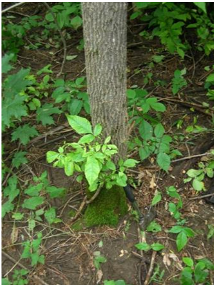
Epicormic sprouting of ash, a symptom typical of ash yellows, Dover-Foxcroft, Maine.

Ash Yellows: The ash yellows pathogen is a phytoplasma organism (similar to bacteria) which invades and colonizes the phloem system of its ash host and develops into a systemic infection. The phytoplasma are presumed to be transmitted by leafhoppers or related insects. Infection by the ash yellows organism results in a gradual growth decline of the tree, with symptomatic dieback of tops and branches occurring over several years. Other symptoms can include epicormic sprouting along the bole and branches, and bark splitting or