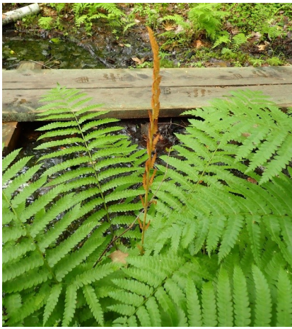
Infertile (green) and fertile (cinnamon colored) fronds of cinnamon fern ( Osmundastrum cinnamomeum ).