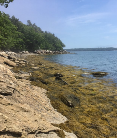
Rockweed, including knotted wrack ( Ascophyllum nodosum ), carpeting rocks in sheltered tidal waters.