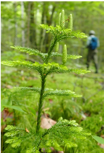
Ground pine ( Dendrolycopodium obscurum ).