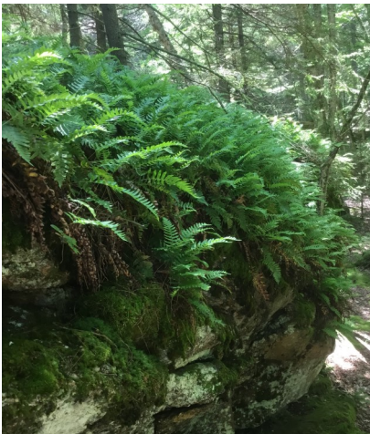
Rock polypody fern ( Polypodium virginianum ) colonizes crevices in boulders and ledges.