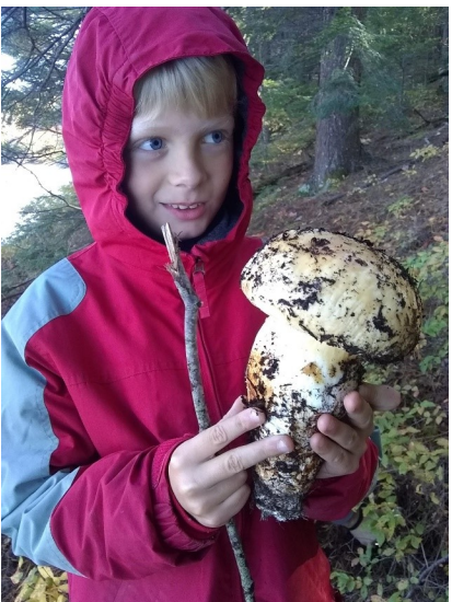
The author's son with large white matsutake ( Trichaloma magnivarle ).

wood fern is widely scattered throughout the park. It can occur in a variety of moist forest habitats, but is less tolerant of open canopy conditions. If the forest canopy is disturbed, such as by wind, fire or insect pests, this habitat would be less suitable for spinulose wood fern. Studies have shown that wood ferns decline following major environmental changes, such as timber harvesting clear cuts.