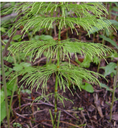
Lacy branches of wood horsetail ( Equisetum sylvaticum )

fairly specialized, and may occur in association with hemlock, red pine, jack pine, and pitch pine. While this species will not disappear from our woods, its extent will be dramatically reduced by the decline of eastern hemlock.