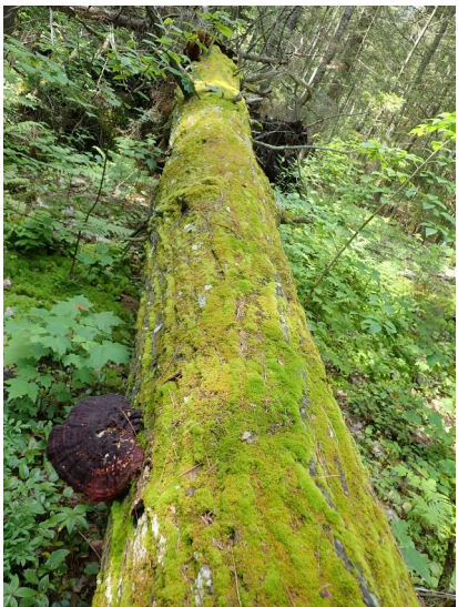
Decaying log with hemlock reishi ( Ganoderma tsugae ).