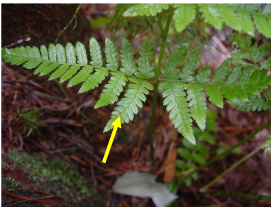
First lowest leafule of spinulose wood fern.

At the trailhead, the forest has a rocky substrate and supports a mix of mature red spruce, red maple and white pine in the canopy. This association of trees is typical in areas of Wolfe's Neck State Park with thin soils. Spinulose wood fern ( Dryopteris carthusiana ) is a common species of mature upland forest at Wolfe's Neck State Park. As a group, wood ferns ( Dryopteris species ) can be difficult to identify, as they freely hybridize when growing in mixed populations. Spinulose wood fern can be distinguished from intermediate wood fern ( Dryopteris intermedia ) by examining the first lower leafules on the lowest leaflets. These leafules are typically as long or longer than the adjacent leafule. In intermediate wood fern, these leafules are shorter than the adjacent leafules. Spinulose wood fern is a species of hybrid origin, with intermediate wood fern and a now-extinct fern species as its parent species. Spinulose