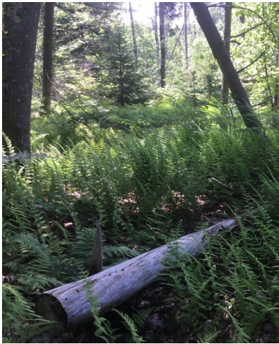
Dense patch of hayscented fern ( Dennstaetia punctilobula ).