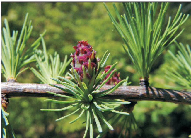
Larch, Maine Natural Areas Program