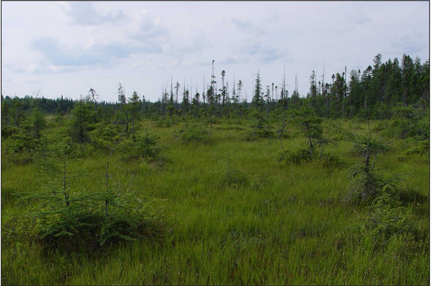
Deer Lake Fen, Maine Natural Areas Program