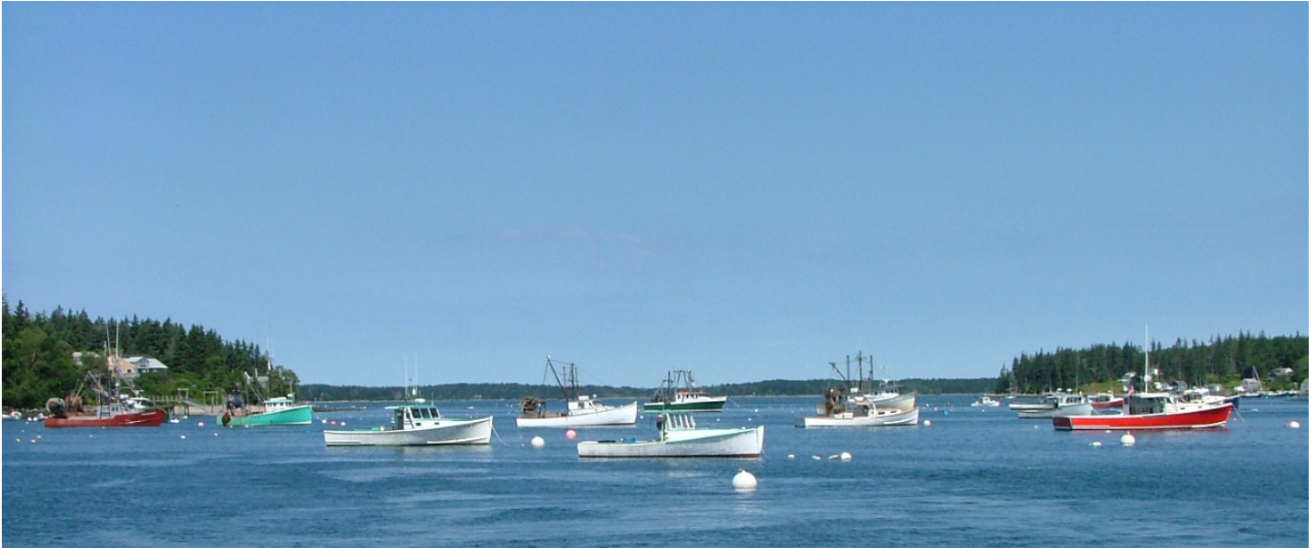
Port Clyde, Georges River Land Trust