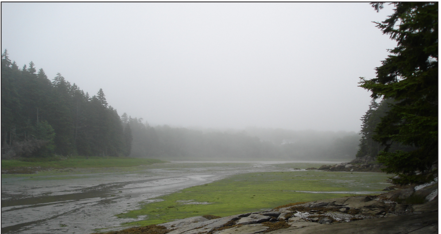
Watts Cove Shorebird Area, Jim Connolly