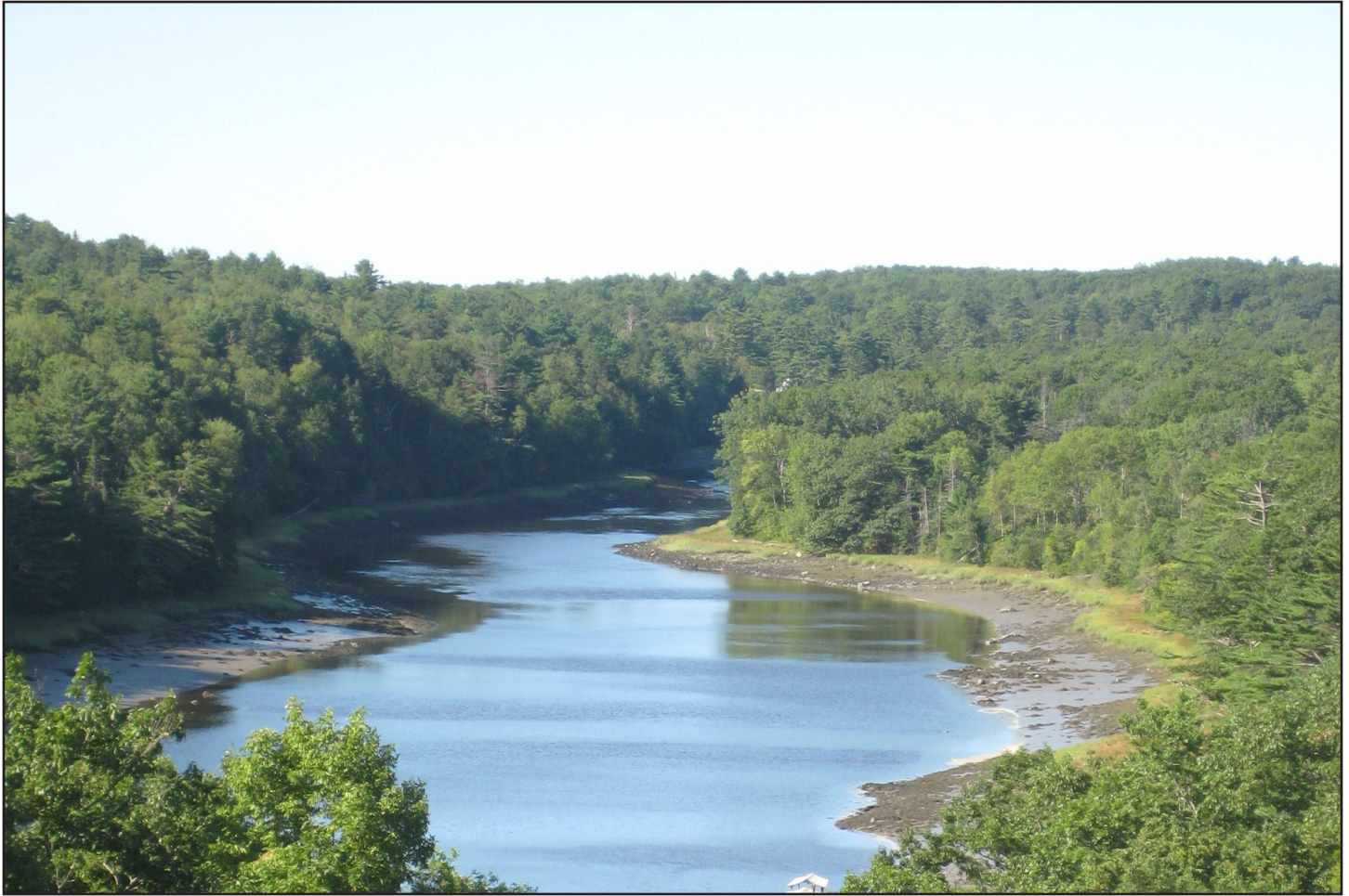
Georges River Land Trust