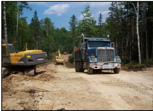
Management Road Construction at Nahmakanta

The Bureau continued to improve road access within its public lands, focusing primarily on recreational needs and implementation of its timber management program. There are currently about 275 miles of public use roads on Public Lands.