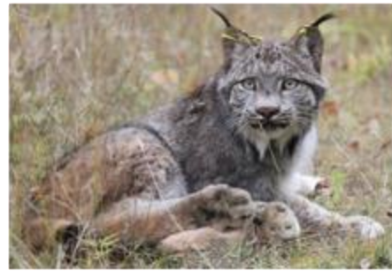
Canada Lynx

Lynx Habitat Management. The Bureau has entered into a Memorandum of Agreement with IF&W to manage a 23,000 acre portion of the Seboomook Unit for the federally threatened Canada lynx. The MOA describes management actions the Bureau will undertake during the 15 year term of the agreement such as timber harvesting activities that will maintain and enhance 6,200 acres of optimum habitat for snowshoe hare, the primary prey of lynx.