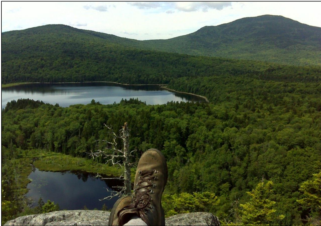
View from Hiking Trail Across Little Moose Unit

MAINE DEPARTMENT OF AGRICULTURE, CONSERVATION AND FORESTRY Bureau of Parks and Lands