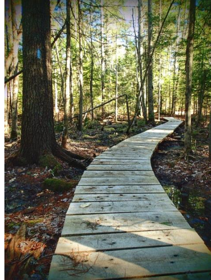
Portion of the South Loop Trail Constructed in the Pineland Public Lands

Pownal and at Pineland Public Lands, with the power corridor trail in between. Work also continued on the Pineland trails.