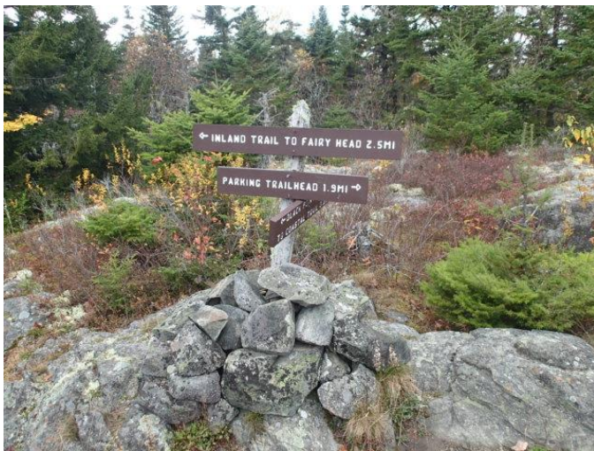
Trail Signs on the Cutler Unit

Cutler Coast. The Maine Conservation Corps, funded through the Recreational Trails Program, continued work rehabilitating trails at the Cutler Coast Trail.